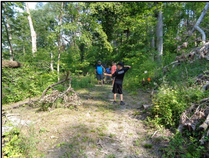
Rendezvous—July 17 th