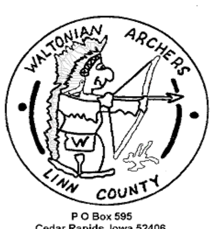
Cedar Rapids, Iowa 52406